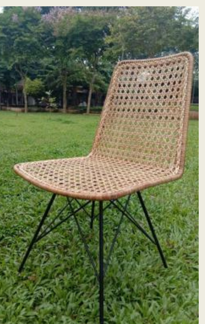
PRICE - RS. 14,000/-