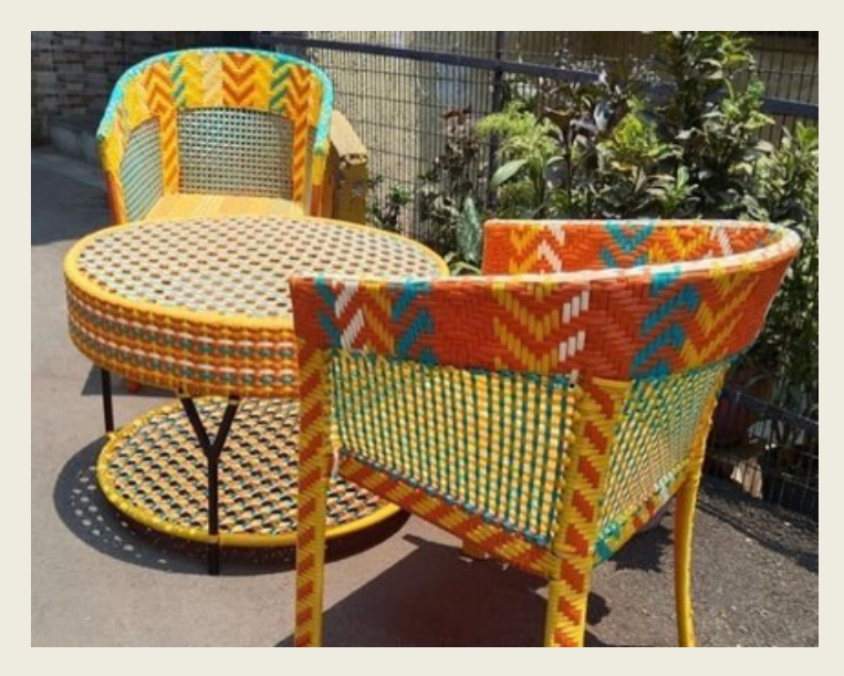
TABLE SIZE - SEAT DEPTH 18" HT 16" CHAIR SIZE - 24" Dia18" Ht

TABLE PRICE - RS. 8,000/-CHAIR PRICE - RS. 10,000/-