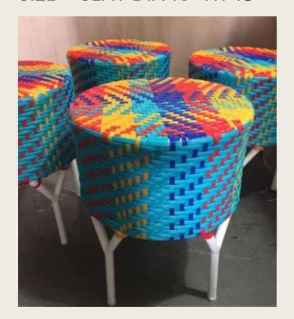
SIZE - 15"X 15"X15"